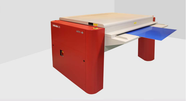
Deploying Agfa Graphics' revolutionary patented cascade system, the Arkana smart plate processor saves printers both time and money, while making operations more ecological and convenient.

Combine Energy Elite Eco with the Arkana smart processing technology to benefit optimally from all of its ECO<sup>3</sup> features. Together with Arkana, the plate achieves an even more efficient use of chemicals, further limiting the production of waste and eliminating the use of rinse water.