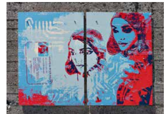
©Barolo Wall | Barolo, Piemonte | Bosch Elettroutensili Professiona