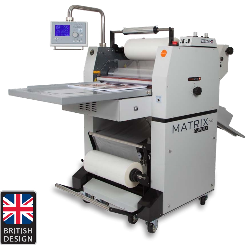
▲ MX-530 DP