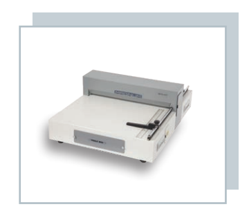
MAGNUM CREASING SYSTEMS