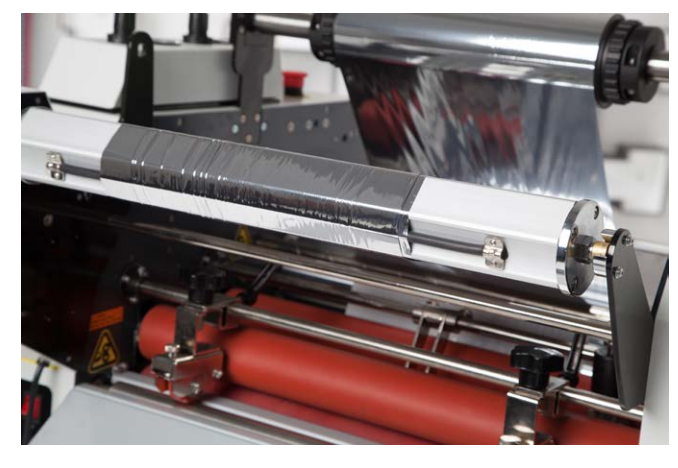
▲ Matrix Take-Up Unit

An optional take-up unit sits at the rear of the Matrix. This can be used in conjunction with the Flatbook device and also when using the Matrix to foil and create Spot UV-style effects. It works in perfect synchronisation with the Matrix and neatly collects spare film and foil.