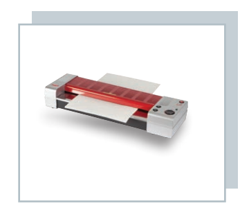
PEAK POUCH LAMINATING SYSTEMS