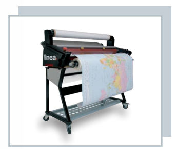
LINEA ENCAPSULATION SYSTEMS