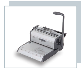
MAGNUM BINDING SYSTEMS