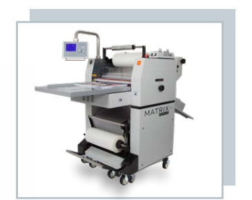
MATRIX LAMINATING SYSTEMS