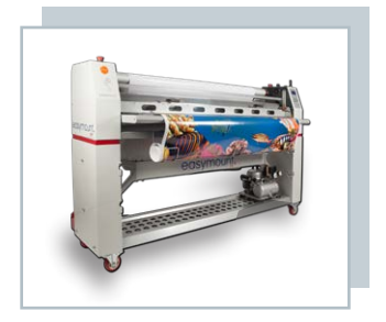
EASYMOUNT WIDE FORMAT SYSTEMS