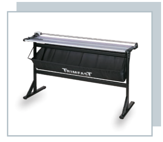
TRIMFAST TRIMMING & CUTTING SYSTEMS