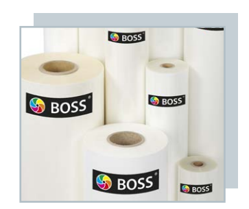
BOSS FILM SUPPLIES

Vivid design and manufacture a wide range of laminating systems, specialising in function, style and reliability.