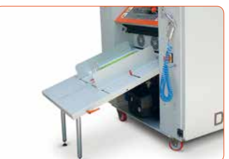
Delivery table with air fans.