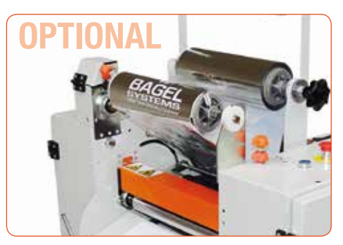
Digital HotStamp® module: La DIGIFAV B2 is available with an optional pallet Multifunctional devise that allows metallic foiling, varnidelivery pile system which can be unloaded using a shing, spot varnishing and cold lamination.