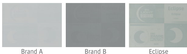
Contrast after 24h of office light